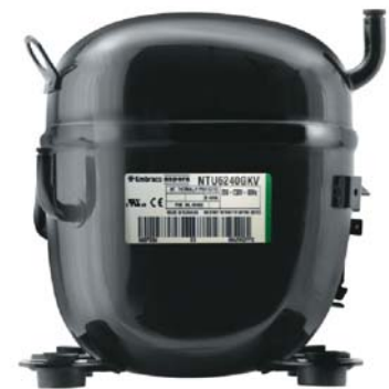
Test conditions Ashrae